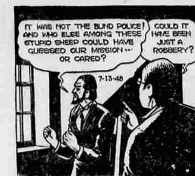
LITTLE ORPHAN ANNIE

Residents of Lane County purchased $35,981 worth of U. S. Savings Bonds during the week ended July 3. This brings the total for the campaign to $676,186 or approximately 43 per cent of the original goal.