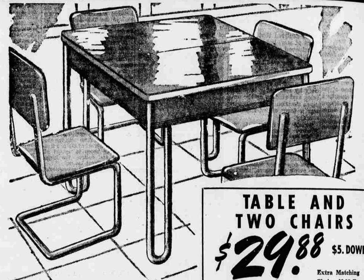
TABLE AND TWO CHAIRS $29.88 $5. DOWN Extra Matching Chairs, $3.95 Ea.