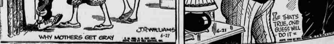
OUT OUR WAX