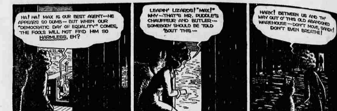
LITTLE ORPHAN ANNIE

CROW ELECTION CROW—The annual school meeting for the grade school will be held Monday, June 21.