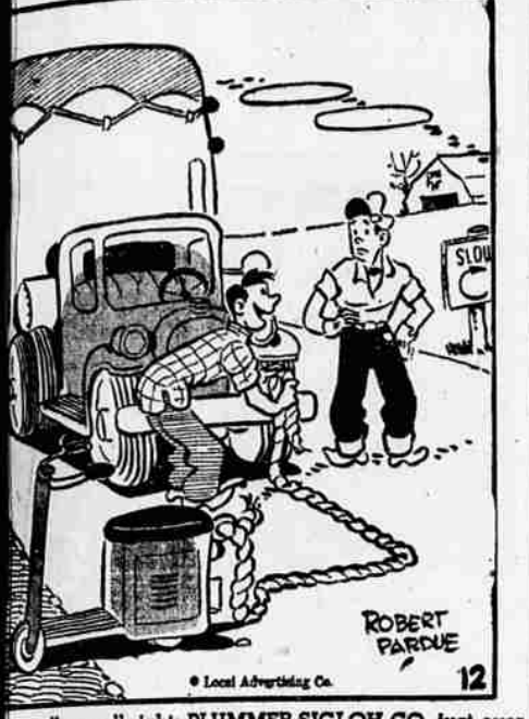
pull you all right: PLUMMER-SIGLOH CO. just over