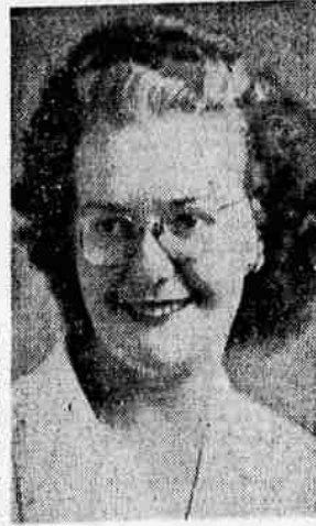
Kennell-Ellis photo, Willshire engraving

WOMEN'S COUNCIL of First Christian Church will meet Wednesday, all day, for sewing in the White Room of the church.