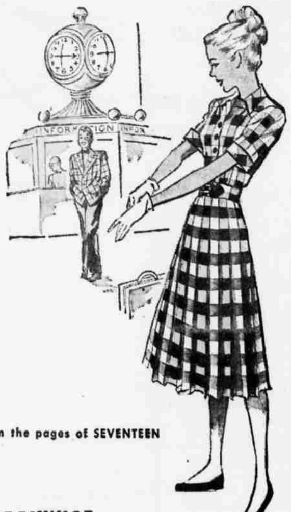
From the pages of SEVENTEEN

featured regularly in... JUNIOR BAZAAR MADEMOISELLE SEVENTEEN CHARM PHOTOPLAY GLAMOUR MODERN SCREEN exclusively with Miller's.