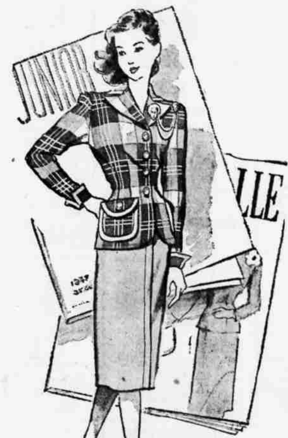
Featured in MADEMOISELLE and JR. BAZAAR