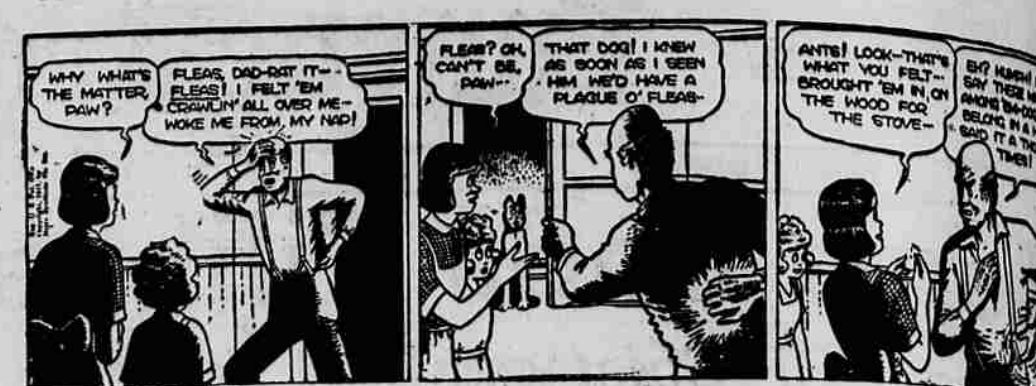
LITTLE ORPHAN ANNIE