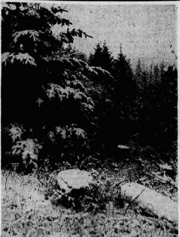
SNOW DECORATES the fir along Dillard Road in the foothills just above Eugene. Snow fell throughout the county Sunday and Monday.

A lone bandit broke a front window at the Weisfield and Goldberg jewelry store at 4 a.m. Monday, escaping with approximately $700 in diamond rings.