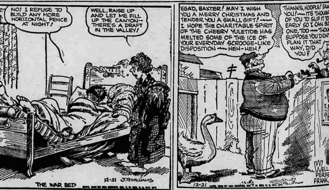
THE WAR BED