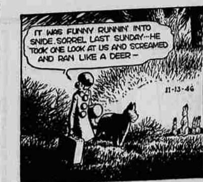
LITTLE ORPHAN ANNIE

ANNEXATION ISSUE LAKE SUCCESS — (AP) — Great Britain Wednesday supported the Union of South Africa's bid to annex southwest Africa over the bitter opposition of the Soviet Union.