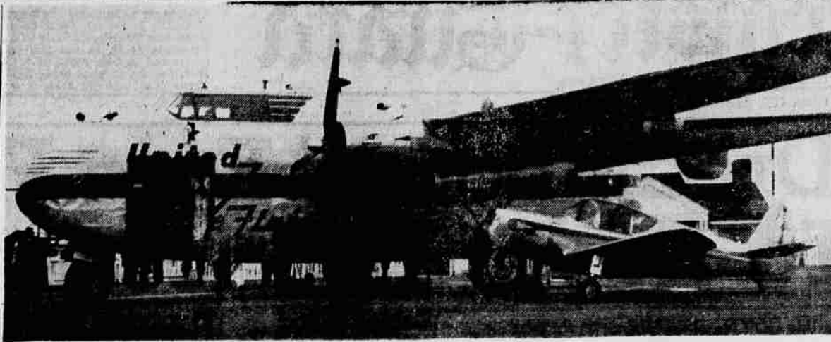
THE FLYING MAILCAR, capable of carrying a nine-ton cargo load of airmail and equipped to sort and cancel the mail while in flight, stands on the Eugene Airport while visitors inspect the postoffice in the hold. Fitting comfortably under one of

British settlers in substantial numbers first arrived at the Cape of Good Hope in 1820.