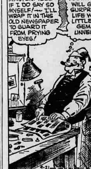
THE WORRY WART