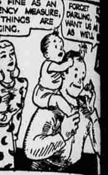
HE CLAIMS IT'S THE ONLY WAY HE CAN RINSE HIS HAIR PROPERLY