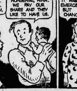
HE CLAIMS IT'S THE ONLY WAY HE CAN RINSE HIS HAIR PROPERLY