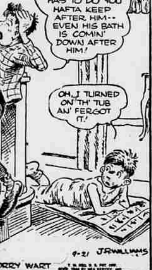
THE WORRY WART