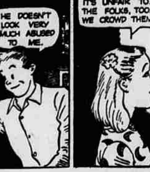
HE CLAIMS IT'S THE ONLY WAY HE CAN RINSE HIS HAIR PROPERLY