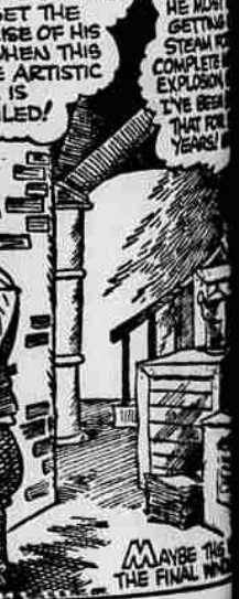
THE WORRY WART