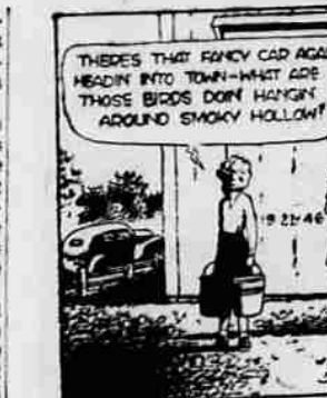
LITTLE ORPHAN ANNE