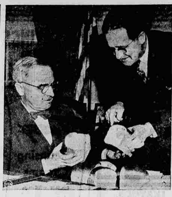
NEW BREAD —President Truman and Secretary of Agriculture Clinton P. Anderson look over bread made from 80 per cent wheat baked in Department of Agriculture ovens. Presidential order for mill of a greater percentage of wheat grain will provide more food for hungry Europe.

A JUICY STEAK? A TEMPTING CHOP? FOR TENDER MEAT HERE'S WHERE TO SHOP! FRANKFURTERS BOLOGNA LIVER SAUSAGE ..... Lb. 29c Assorted Lunch Meat ..... Lb. 35c Fresh Pig Feet ..... 6 lbs. 25c Bacon Rinds ..... Each 5c Boneless Corn Beef Plates ("A" gr.)...Lb. 25c "THE HOME OF FINE STEAKS" Eugene Packing Co. PHONE 38 675 WILL