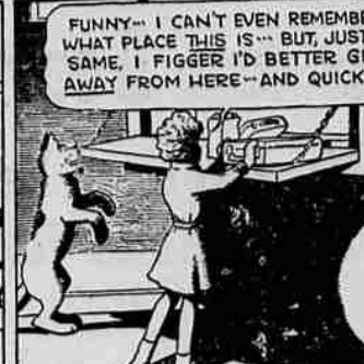
LITTLE ORPHAN ANNIE