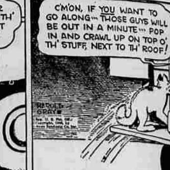
LITTLE ORPHAN ANNIE