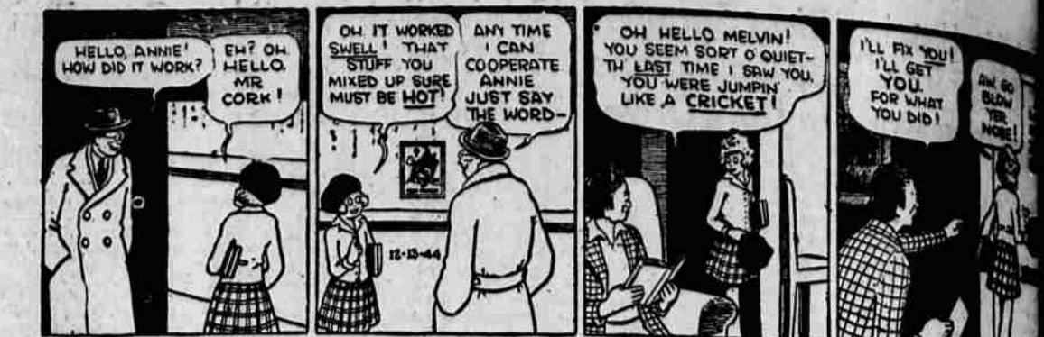
LITTLE ORPHAN ANNIE

NEW YORK, Dec. 12 (AP) —Gypsy Rose Lee, former burlesque performer and author of "The G-String Murderer," gave birth to a five and one-half pound son today, the same day her divorced husband was expected to re-marry.