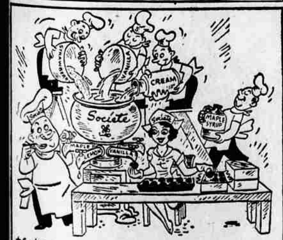
* Societe CHOCOLATES ARE FILLED WITH A CREAM SEPARATOR...

*Fancy, of course, but it IS A FACT that you'll find cream-smoothness among the varied centers of Societe chocolates. "Candy is Food for Work!" Societe supports this National Council on Candy program... Some candy goes to war, too, but remember— "Societe is Worth Waiting For!" IMPERIAL CANDY CO SEATTLE 4, WASH.