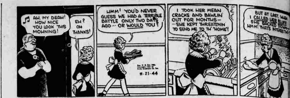
LITTLE ORPHAN ANNIE