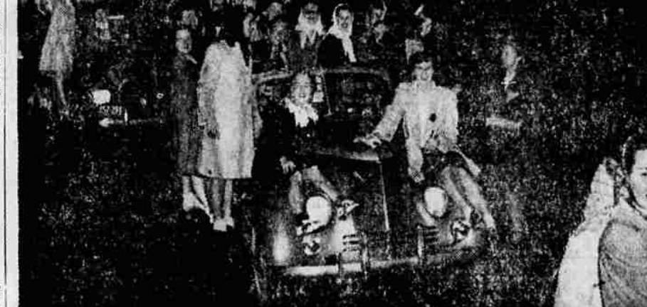
SCENES AT THE BRICKER RALLY—Gov. John W. Bricker of Ohio, republican vice-president nominee, was saved a brand of western enthusiasm that left the candidate and his entourage astonished when they came to Eugene Thursday evening for Bricker's principal Oregon speech. University of Oregon Young Republicans whooped it up at the S.P. station, where they greeted Bricker, then paraded through the downtown district and to McArthur court on the campus, where there was "roof raising." Upper right above—Bricker addresses the throng in McArthur court. Upper left, top to bottom: Wayne Morse, republican candidate for the U. S. senate, long term, speaking to the crowd that gave him a rousing welcome; Senator Guy Cordon, republican incumbent candidate for the senate, also short term, comes to the mike; Congressman Harris Ellsworth, Oregon fourth district, makes a few remarks. Bottom picture—The big parade passing a long Willamette street.