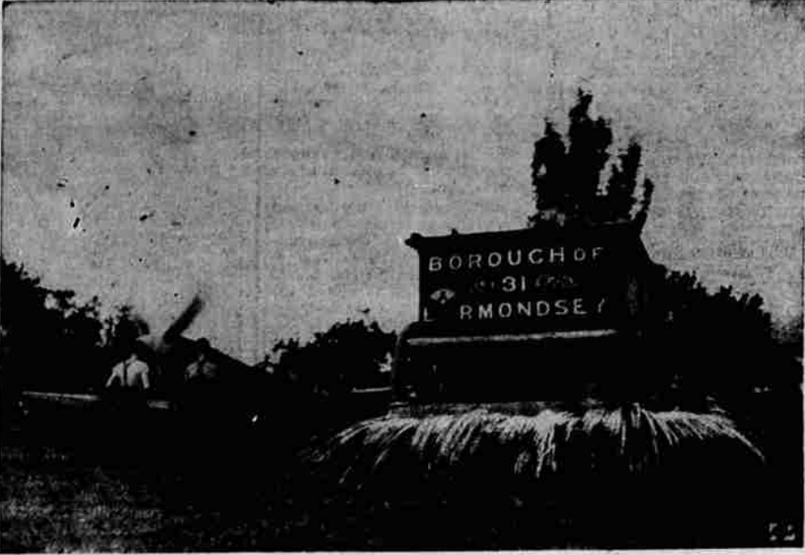
LONDON SPRINKLER IN FRANCE —A water cart belonging to the London borough at Bermondsey lays the dust at a Spitfire dispersal point somewhere in Normandy.

PLEASE DO . . . Use stamps or money order if possible, or if you must use coins, wrap securely and fasten down with sticker tape. See that your envelope is sealed tightly.