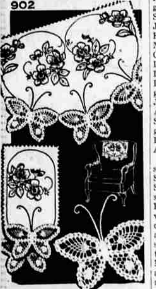
by Laura Wheeler

Three single crocheted butterflies add a lacy touch to this embroidered chair set. The wild roses are mainly in outline stitch in natural colors.