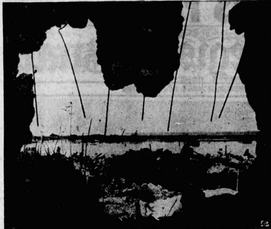
BEACHHEAD AT GUAM — A view of the beachhead at Guam during difficult unloading operations, made through a shell hole in a concrete building.