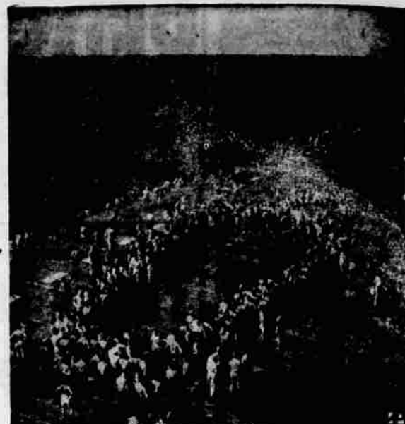
POST-BATTLE GAME — On the deck of a U. S. aircraft carrier on route back from action in the Pacific, enlisted men engage in a lively game of medicine ball.

But in Florida, in southern Texas and on west and up the coast, it was weather pretty much as usual. (Exception: Denver's 8-inch hail storm Saturday.) And things certainly were humming in Yuma, Ariz. The thermometer hit 113 there.