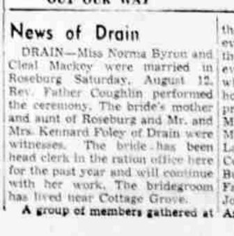
News of Drain