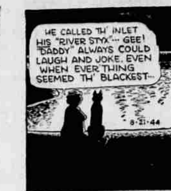
LITTLE ORPHAN ANNIE

When cooking snap beans for dinner, plan on having enough left over to be chilled in the refrigerator and used in a salad a day or two later. They are especially good served with a bacon dressing.