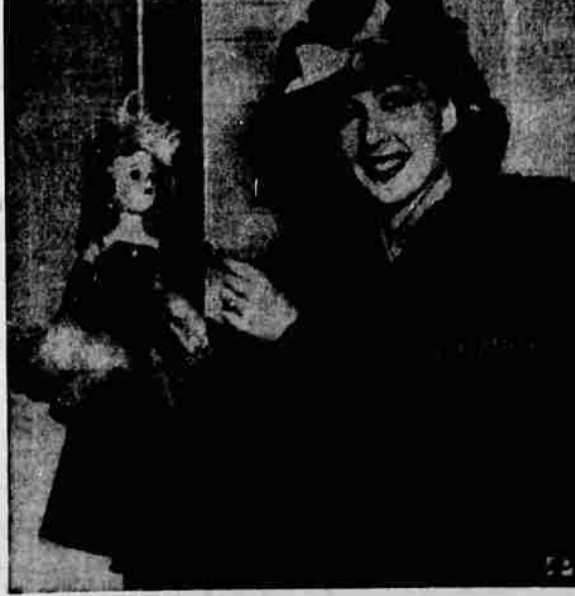
THEATRICAL DOLL —Leticia Veres, Rumanian actress featured in a Broadway musical show, exhibits a gift from a friend—a doll dressed in a miniature copy of one of the costumes she wears on the stage.