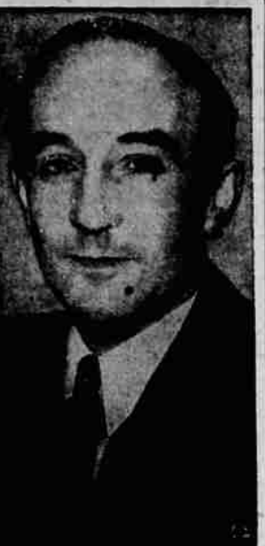
DIPLOMAT — Frank Kenyon Roberts (above), 35, of the British foreign office, helped negotiate pact with the Portuguese government giving the Allies use of Azores bases.

PLEASE DO . . . Use stamps or money order if possible, or if you must use coins, wrap securely and fasten down with sticker tape. See that your envelope is sealed tightly.