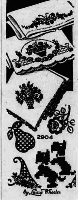
When you see this generous collection of varied motifs, you'll not know which one to do first. Here's your opportunity to pile up linens made smart with just a touch of embroidery. Pattern 2904 contains a transfer pattern of 22 motifs ranging from 1 1/2 x 2 1/4 to 4 1/2 x 1 1/4 inches; stitches, list of materials.

Send ELEVEN CENTS in coins for this pattern to Register-Guard, Needlecraft Dept. Write plainly PATTERN NUMBER, your NAME and ADDRESS.