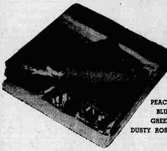
PEACH BLUE GREEN DUSTY ROSE

Wool of the West Vogue 13 95 72x84 inch size