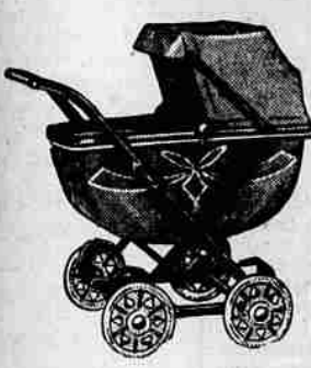
Models priced at 22.50, 29.50, 34.50, and up.