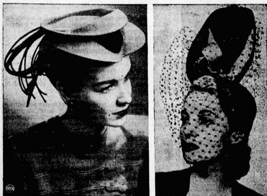
You can have 'em low—and you can have 'em high, this spring—and both kinds of bonnets will be right in style, as evidenced by the pair of millinery fashion inspirations pictured above. The one at left is a charming double-decker of Sally blue felt, the crown being a little hat in itself, set on a sweetheart brim. Black straw cording forms a many-looped bow and streamers for decoration at the back. Of course, if you want to go "high hat," you can have a topper like that at right, reminiscent of the Empire mode. Of navy blue felt, it's trimmed with an upside-down madonna blue velvet bow. The high, shell-shaped brim is attached to a little cap, making an effective adjunct to the chignon coiffure.