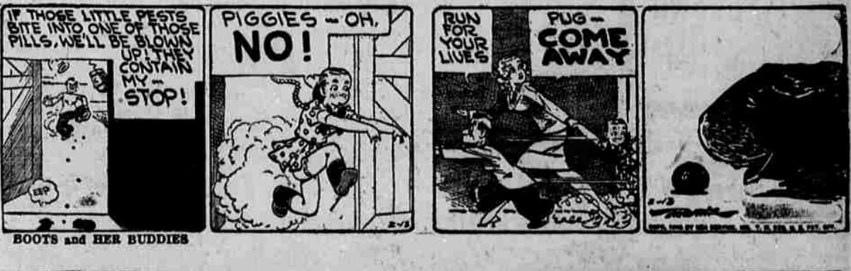
BOOTS and HER BUDDIES