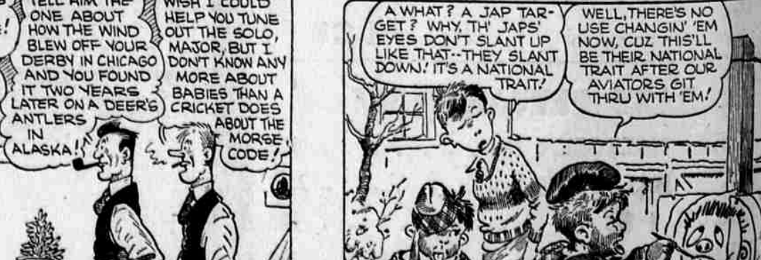
THE NEW SLANT