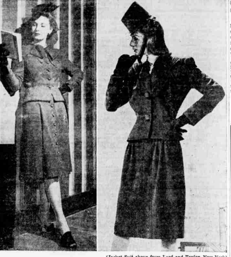
TRIM AND SMART. That's the story of the above all-wool suits for the fall fashion parade. Both are collarless, bow-necked suits with short jackets and unpressed pleats in the skirts. The one on the left is electric, or brunket, blue in color. Fabric is all-virgin wool. The New York creation, right, is purple wool crepe; the scarf is cerise. The matching hat is of purple and cerise with a grosgrain ribbon outlining the veil.

MONTHLY PAIN which makes you CRANKY, NERVOUS If you suffer monthly cramps, backache, dizziness, "irregularities," nervousness—due to functional menstrual disturbances—try Lydia Pinkham's Compound Tablets, with added Iron. Made especially for women. They also help build up red blood. Follow label directions. Try it!