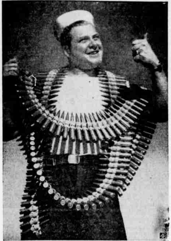
THUMBS UP—This husky Coast Guardsman wrapped in a bandolier of bullets indicates he is ready to take it and dish it out.

FRAGER'S... SUMMER CLEARANCE... of DRESSES... $3.98 to $6.95... FRAGER'S 829 WILLAMETTE... PHONE 4961-W