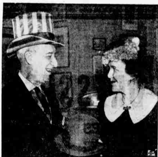
FORSAKES BROWN DERBY—Al Smith laid aside his famed brown derby as he bought a war bond show ticket.