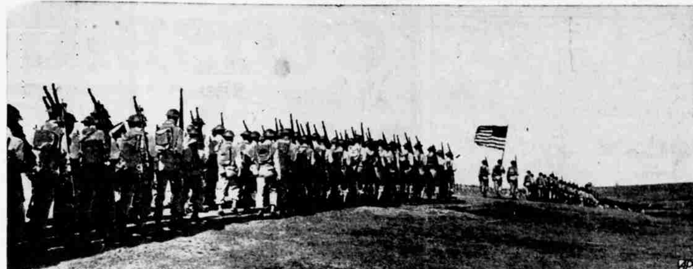
'OLD GLORY' ON THE MARCH IN AUSTRALIA —The Stars and Stripes stream in the wind as a column of American troops marches over rolling country in far away Australia. More U. S. soldiers march with 'Old Glory' there as United Nations forces prepare to repulse Jap onslaught or to launch an offensive.