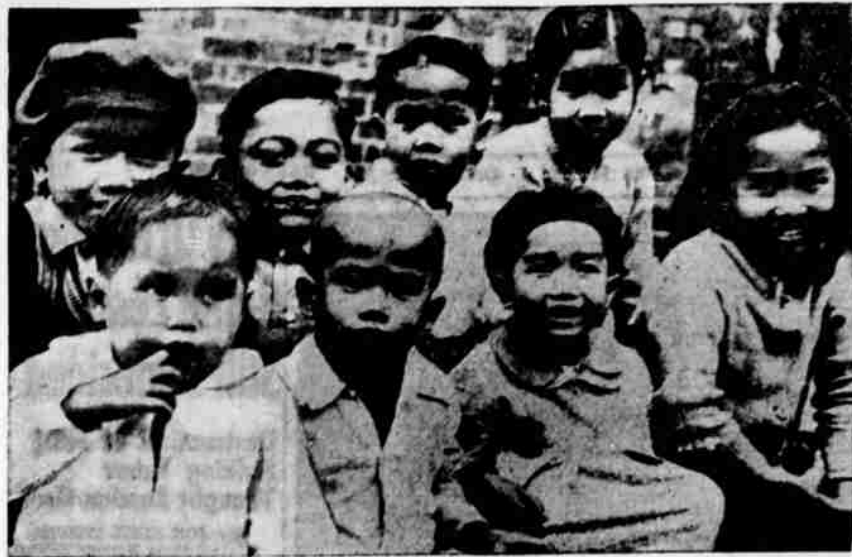
FOLLOWING THE RUTHLESS PATTERN set in Europe, children of the Orient, too young to understand the terror which has come upon them, are driven from their homelands by the relentless forces of war. Evacuated from Sumatra when the Jap invader spread his terror, these Javanese and Chinese youngsters pose willingly at the Port Melbourne, Australia, hospital, which has become their refuge.