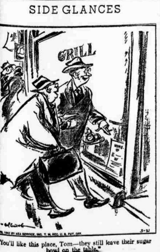
"You'll like this place, Tom—they still leave their sugar bowl on the table."