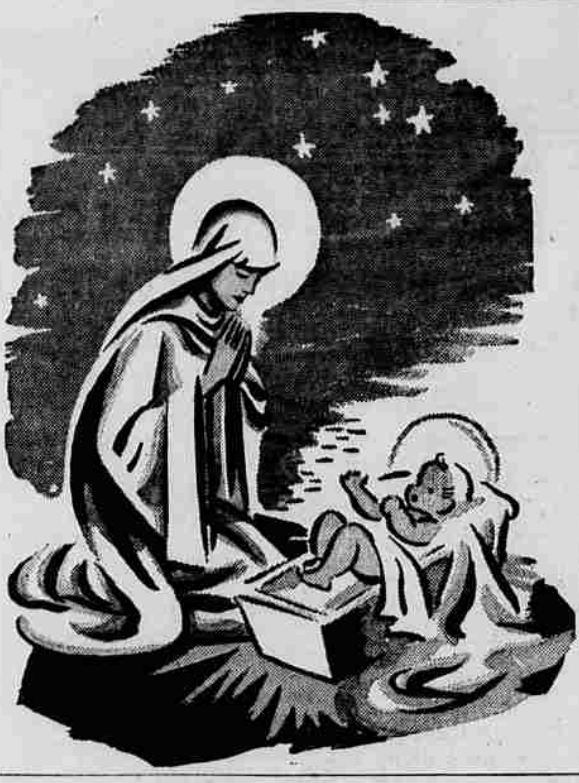
Tableau Announced By Presbyterians The special program to be presented during the Sunday school hour at the Central Presbyterian church includes a tableau entitled "O Come, Let Us Adore Him." The beginners and primary departments will sing as the Christmas story is read. The choir will sing "O Come All Ye Faithful" and "We Three Kings" as the white gifts are brought to the altar.