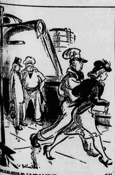
Never misses bringing the streamliner in right on time—but his wife always meets him so he won't forget to get home in time for dinner.