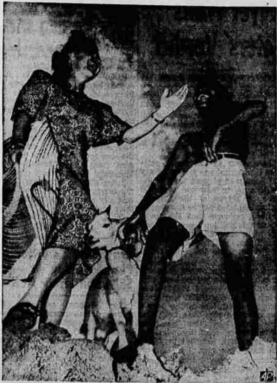
TIPS FROM AN EXPERT—Opera Singer Grace Moore gets pointers in native calypso singing from a lad in Puerto Rico, where Miss Moore stopped en route to South America. Puerto Rico has been under Stars and Stripes for about 43 years.

A pound of coffee contains approximately 3850 beans.