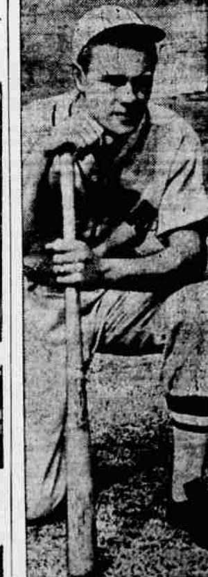
WHEN NEXT YOU HEAR from Paul Christman, the Missouri football star will be trying for a major league berth.