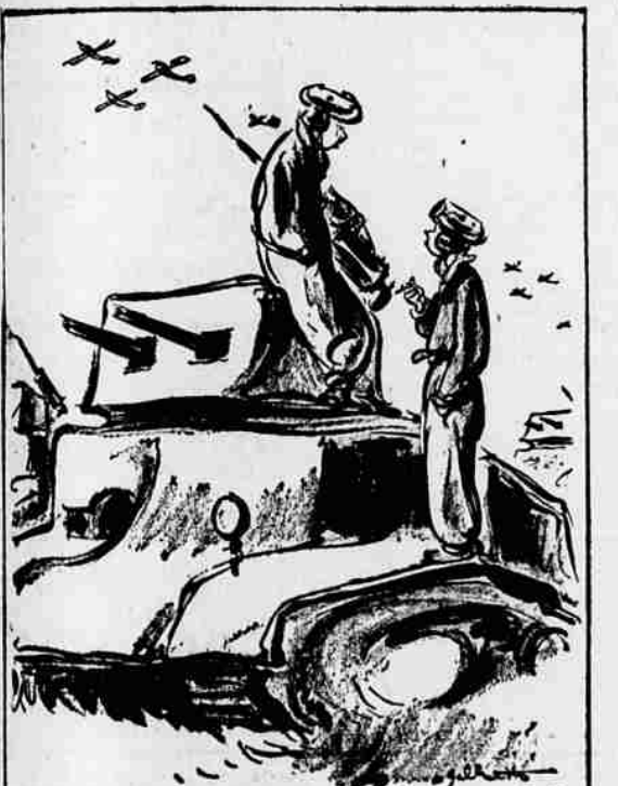
"And I thought I'd get out of running a tractor on my old man's farm by joining the army!"