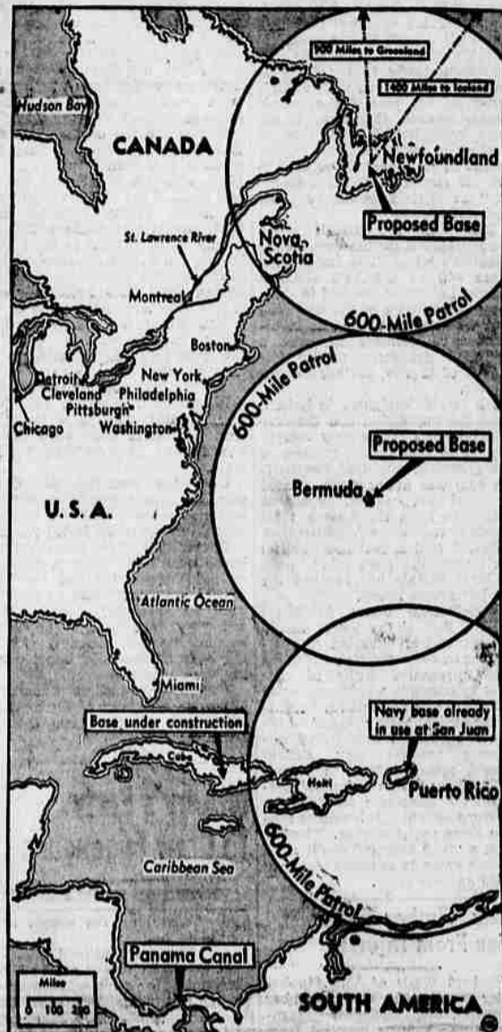
LONDON WEDNESDAY HEARD RUMORS of attempts to forge an Anglo-American military alliance. Both nations have confirmed reports negotiations are nearly complete to give the United States naval and plane base sites on British islands in the western Atlantic. This map shows the strategic advantages of an off-shore defense line.

The picnic and meeting planned by the county central democratic committee at Cottage Grove for Wednesday evening has been postponed. Date for the event will be set later.