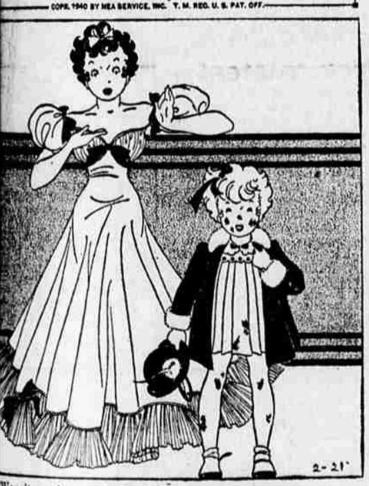
"Was it a nice party, baby?" "Ooh, swell! We didn't hafta play games or anything."