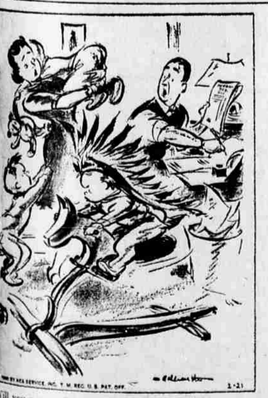
Will your personal exemptions go up and get to bed so you can figure out my income tax!