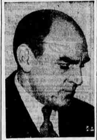
ON SPOT—Britain's new minister of information is Sir John Reith (above), who succeeded Lord MacMillan in war censorship office that even the Britons criticized.