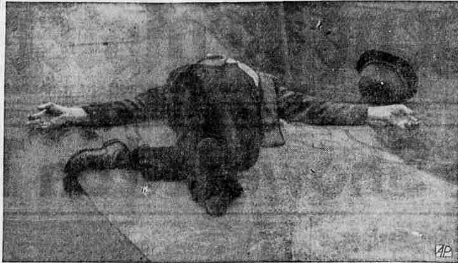
TOO REAL FOR COMFORT —Bystanders sighed over the fate of this unfortunate man, so realistic was his portrayal of an air-raid "victim" during a recent drill at Sydney, Australia. The drill, staged by Australia's national emergency service to awaken residents to possible war dangers, included the bursting of a bomb and medical aid for victims.

In Wednesday's thrusts at the line, the Russians concentrated the heaviest bombardments yet seen in this war, but in spite of the Russian losses, which every Finnish soldier says have been terrific,