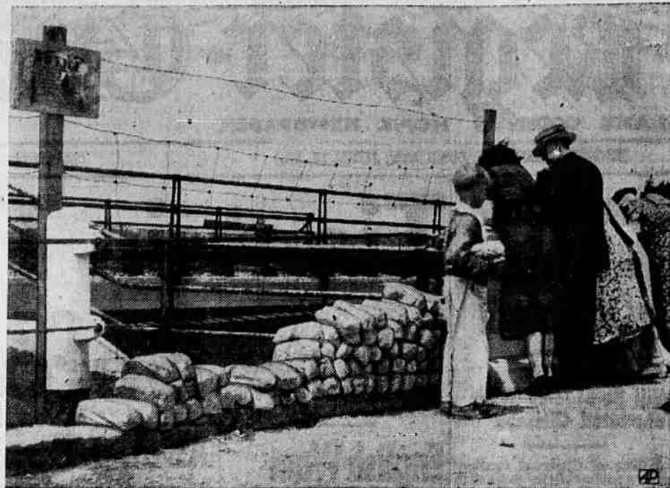
BREAD is cast upon waters—Feeding the fishes has become such a popular sport at the Pymatuning dam game refuge (above) at Linesville, Pa., that bread dealers pile up stale loaves and wait for customers. On good days as many as 5,000 loaves are sold from a single stand. Vigilant state police make sure that no one casts a hook, instead of bread, into the waters.

Method of collecting fees from water users who have declined to