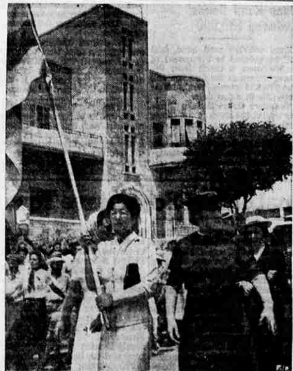
HOLY land parade—Jewish women march through Jerusalem protesting Great Britain's decision to establish an independent, Arab-dominated state of Palestine, in which Jews would be a minority people having one-third of the population.

Rush For Tomorrow's Paper For More Interesting Details!