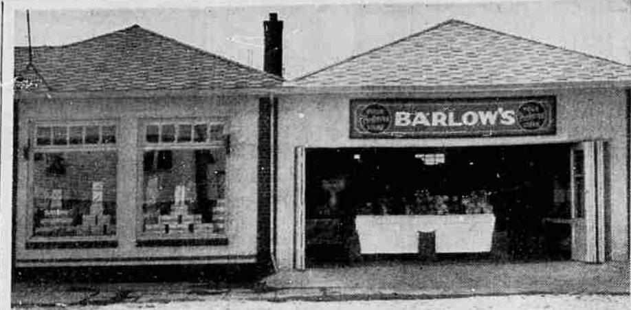
HERE is Barlow's newly-enlarged grocery store which will have its opening to customers and friends Saturday. The store is located at Nineteenth and Agate streets.