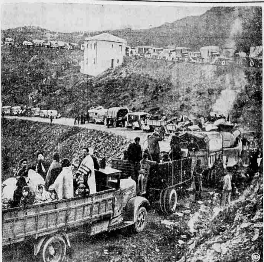
THIS winding mountain road near Cerbere on the French-Spanish frontier is a traffic-jammed, one-way street as the endless train of trucks inches along, carrying Loyalist refugees to safety in France.