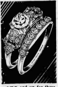
$75 and up for these TWO RINGS