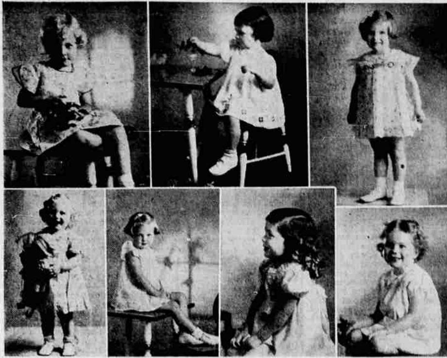
LITTLE GIRLS GROUP WINNERS