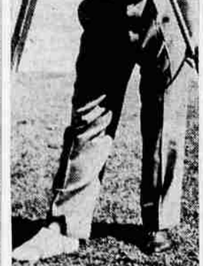
A MERE matter of a broken ankle falls to stop Frankie Frisch from taking part in the St. Louis Cardinal activities in spring training camp at St. Petersburg, Fla. The peppery Red Bird pilot, leaning on a pair of crutches, is shown getting in a vociferous word or two from the sidelines.