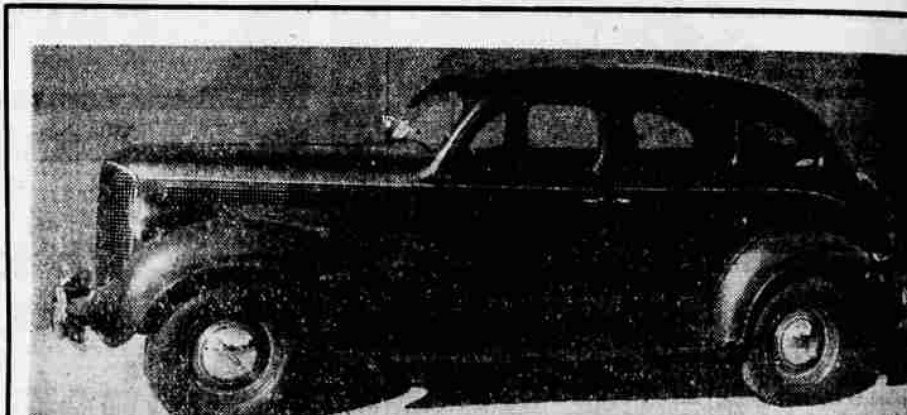
$1099.50 — (1938) DODGE 4-door touring sedan. Purchased and on display at Sigloh-Sawyer Co., 1056 Pearl.