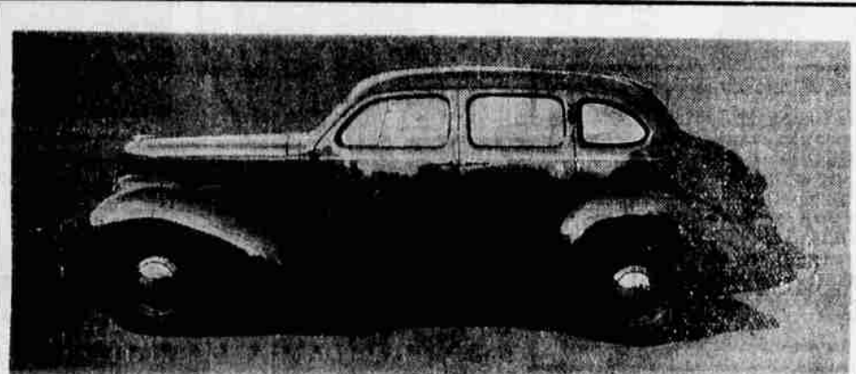
$1220.00 — (1938) STUDEBAKER Commander Cruising Sedan, purchased and on display at Bailey Motor Co., 971 Oak.