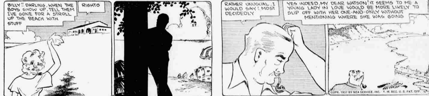
WASH TUBBS Catch as Catch Can By CRANE