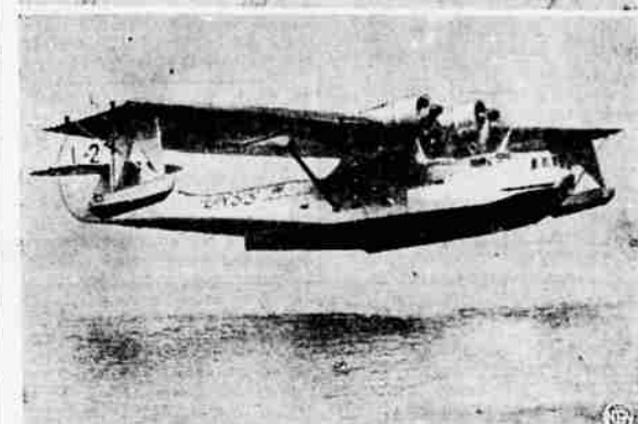
WITH Sir Hubert Wilkins, Arctic explorer, and a crew of four aboard, the 17-ton flying boat Guba in lower picture rises from the water at North Beach Airport, L. I., on the first leg of a flight whose objective was to search for the six Russian flyers who were forced down in the northern wastes on a trans-polar flight.