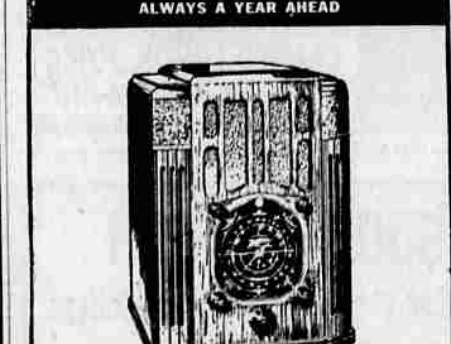
ZENITH MODEL 10-B-130 A big 10-tube chassis ingeniously built into a table cabinet. Foreign reception guaranteed. Has the Big Black Zenith 1937 Dial and new features.

AMERICA'S MOST COPIED RADIO ALWAYS A YEAR AHEAD