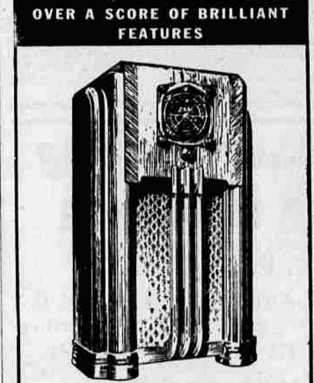
ZENITH MODEL 8-S-154—A Most Unusual Design—of great simplicity, Powerful 8-tube superheterodyne. Foreign reception guaranteed. Has Voice-Music High Fidelity Control, Acoustic Adapter, Lightning Station Finder, Target Tuning, Overtone Amplifier.

AMERICA'S MOST COPIED RADIO ALWAYS A YEAR AHEAD