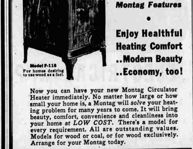
Model F-118 For homes desiring to use wood as a fuel.

Now you can have your new Montag Circulator Heater immediately. No matter how large or how small your home is, a Montag will solve your heating problem for many years to come. It will bring beauty, comfort, convenience and cleanliness into your home at LOW COST. There's a model for every requirement. All are outstanding values. Models for wood or coal, or for wood exclusively. Arrange for your Montag today.