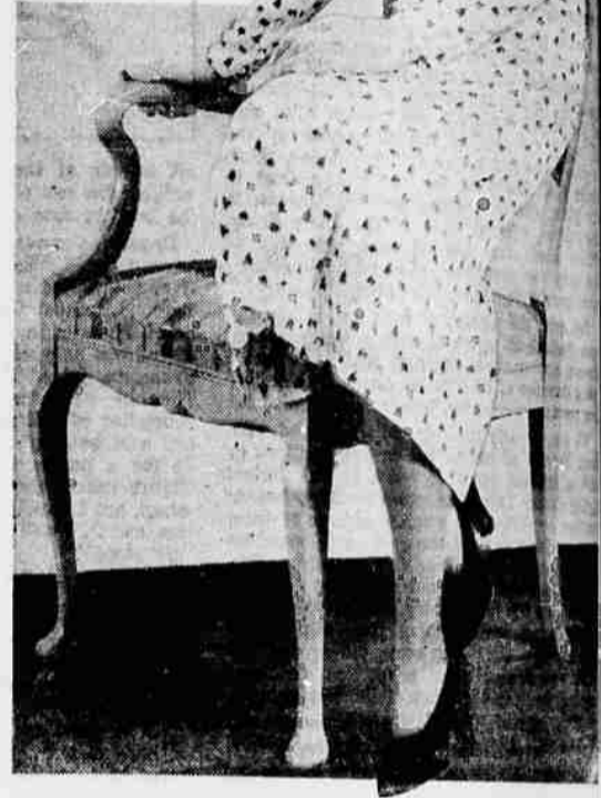
Daytime frock featuring modified surplice closing.

Pattern No. H-3155 THIS lovely daytime frock, worn by the stunning dark-eyed Priscilla Lawson of Universal, has the ability to stress good points in an unusually effective way. The modified surplice closing is much favored, especially for adult sizes, and three attractive bone white buttons are used to add novelty.