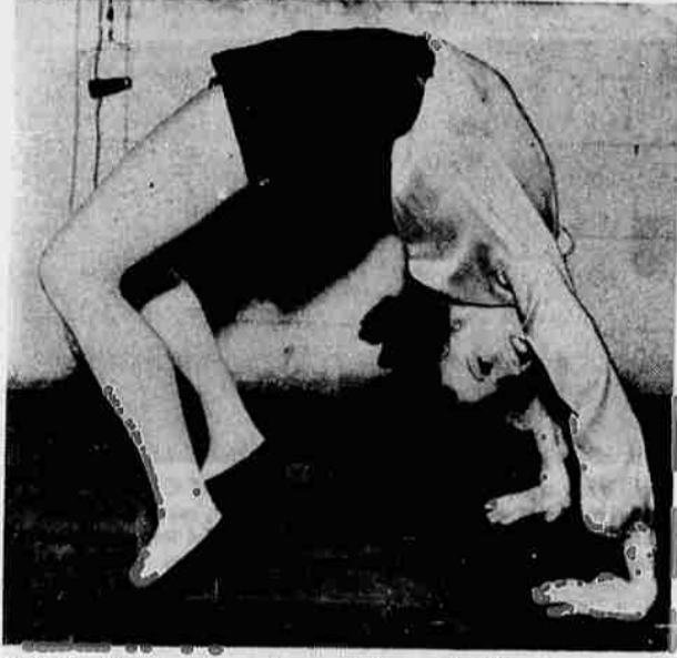
Gail Sheridan, lovely movie star, believes that "keeping in condition" is a vital aid to beauty, particularly in helping her to face the camera with unimpaired charm after long hours at the studio.